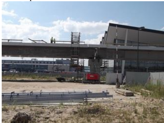
GDN Train Station

GDN has a co-located train station (see below). However, currently it does not have a direct connection to Slupsk. One should take the train towards Gdansk Main (Gdansk Głowny), exit the train and buy a ticket to Slupsk there.