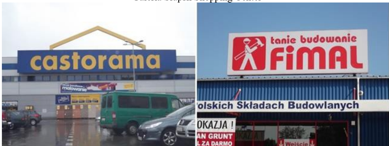
Castorama and Fimal Hardware Stores