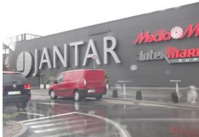
Jantar Shopping Center