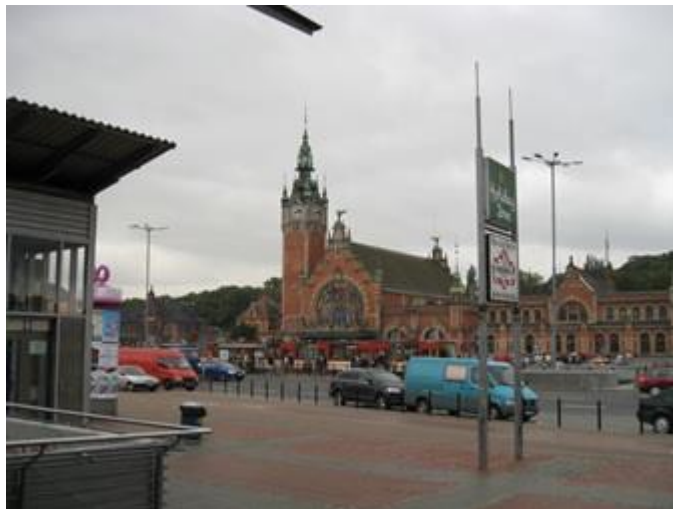
Gdansk Main Train Station

To obtain a ticket for fast/express train from Gdansk Main (Gdansk Glowny) to Slupsk, ask for the express ticket on the ground level of the main station. Cash and major credit cards are accepted at this train station. Platform (“peron”) stairs lead to the tunnels and provide access to other tracks, the main station and an easy way to cross the street to the east and get to old town. Please refer to http://old.rozklad-pkp.pl/bin/query.exe/en? for train connections in Poland.