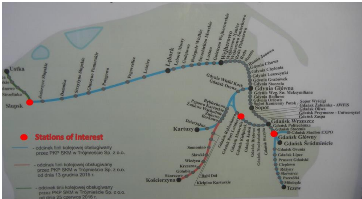
Map of Rail Service between Gdansk and Slupsk

If taking the train from Gdansk to Slupsk, take a taxi or the #210 bus (3N at night runs the same route as 210 during the day) from the airport to the train station in Gdansk. There is also a newly built train line running from GDN to Gdansk Main. The following tips apply if the traveler chooses to take the train from GDN to Gdansk Main (Gdansk Glowny):