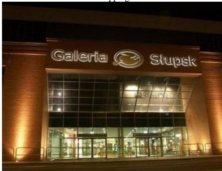
Galeria Slupsk Shopping Center