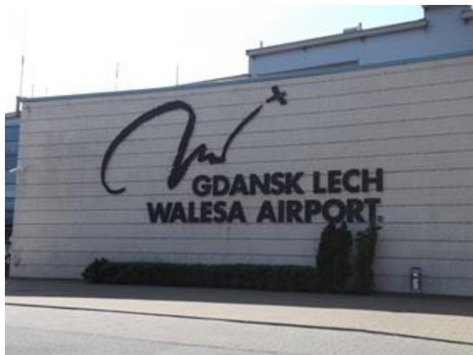
Gdansk Lech Walesa International Airport (GDN)

The BOSS contract provides Airport shuttle service to and from GDN upon request. The Office Management Assistant handles coordination for that service. A photo of the airport is provided in the picture below.