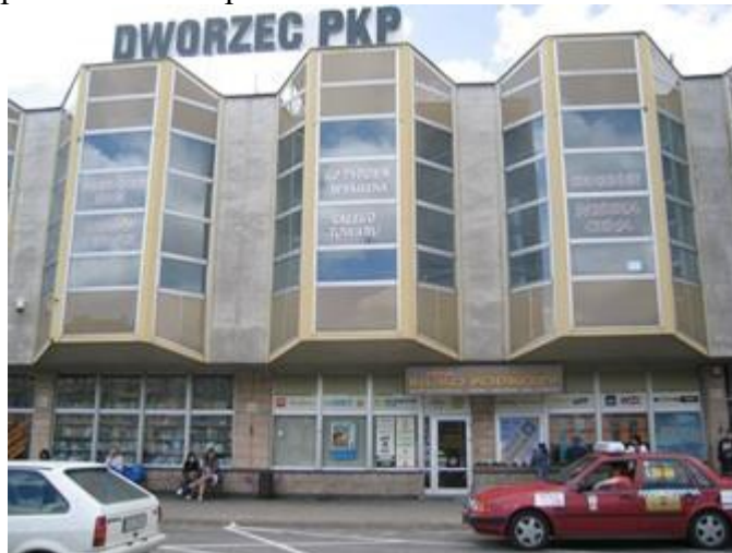
Slupsk Train Station

The nearest train station to Redzikowo Base is located in downtown Slupsk, approximately 6 km from the Base. See a photo of the Slupsk Train Station below.