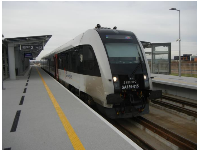
Train From Gdansk Main to GDN

A photo of the train to the airport is provided below. Only this style of train goes to the airport.