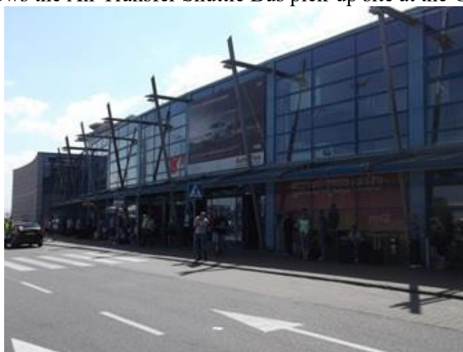
Air Transfer Shuttle Bus Pickup Site

The picture below shows the Air Transfer Shuttle Bus pick-up site at the Gdansk airport.