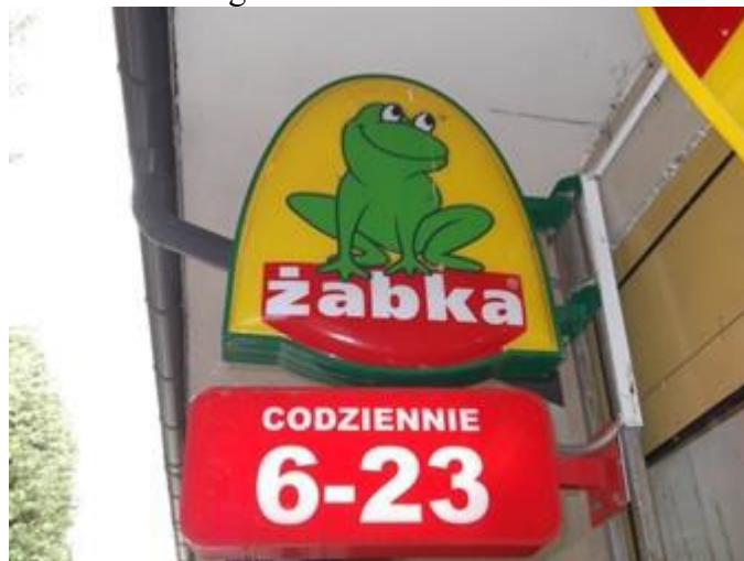
Zabka Convenience Store

Most places accept credit and/or debit cards as a form of payment. Some honor American Express, but most do not due to the high fees.