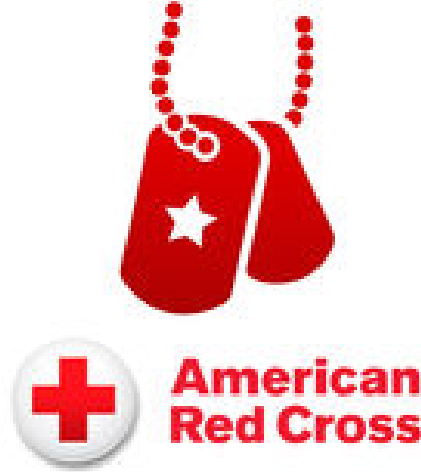
Hero Care Network