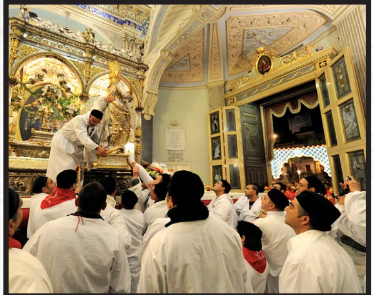
The Paternò long-standing and traditional religious festival honoring Santa Barbara (Saint Barbara), the town’s patron saint, makes a return after the pandemic hiatus from December 3 thru 5. Townspeople and hundreds of tourists look forward the coming of this festa in order to take part in the processions, go to holy masses or simply to watch them from squares and balconies. A vibrant and colorful event, it features religious celebrations live music, arts & crafts, fireworks and entertainment.

According to legend St. Barbara also intervened to stop a terrible Etna eruption in 1780. The “miracle” occurred after Paternò townspeople carried her relics in procession near the town of Ragalna on the slopes of the volcano. St. Barbara is still invoked to grant safety from lightning, thunderstorms, and fires. Since the Middle Age, she has been regarded as the patron saint of those who are in danger of fire or explosions. She is also associated with artillerymen, fire