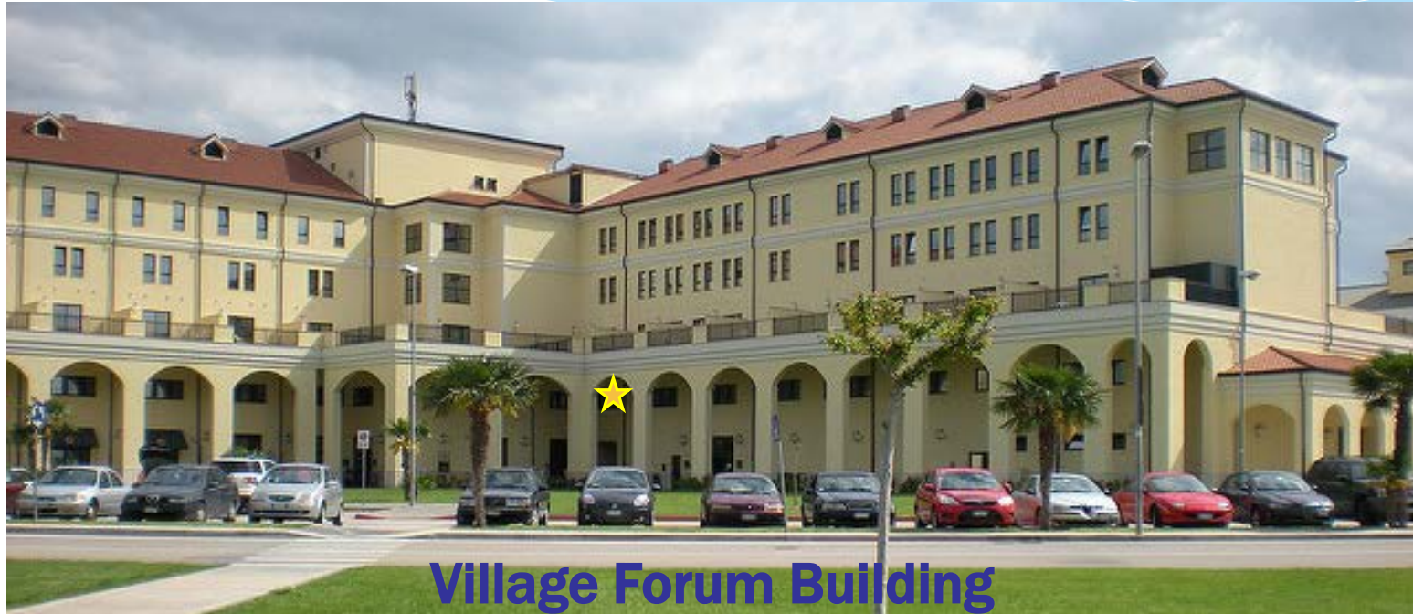
Village Forum Building